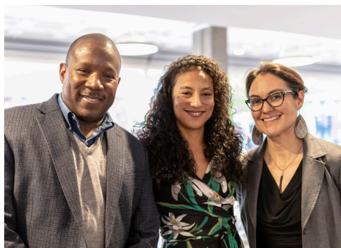
Panelists from the Du Bois Society Graduate Student forum “We the People of Color: Negotiating Positionality, Scholarship & Activism”

The Graduate School of Arts and Sciences is committed to helping you develop and sustain a productive and supportive relationship with your advisors and mentors. Although the advising structure and role may vary by program, all entering graduate students will have one or several advisors to assist them in navigating their academic path. Harvard faculty are uniquely invested in the success of their graduate students,